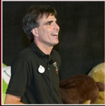
RANDY PAUSCH — The Last Lecture

If you haven't heard of him yet, you must not be one of the seven million people who has seen his famous "Last Lecture" given at Carnegie Mellon University, short months before his death of pancreatic cancer. Created as a memorial and inspiration for his children with lessons on what really matters and how to achieve one's dreams, this lecture was delivered before a standing-room only crowd in his computer science class that was filmed and has been circulated for the world to share. His messages are simple, funny and heartfelt: he's realistic without being maudlin and meaningful without being pedantic. Everyone from Diane Sawyer to Oprah is a fan of what is clearly a legacy of values , except delivered in a stand-up format. You owe it to yourself to be inspired. To view the video, visit www.youtube.com/watch?v=ji5_MqicxSo .